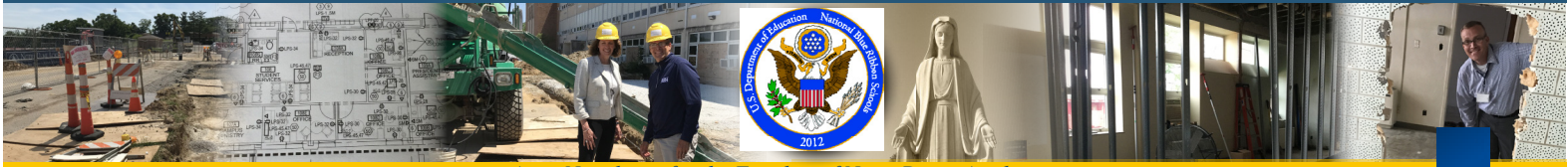
An e-Newsletter for the Families of Notre Dame Academy